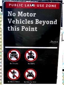
Sign posted at non-designated trails